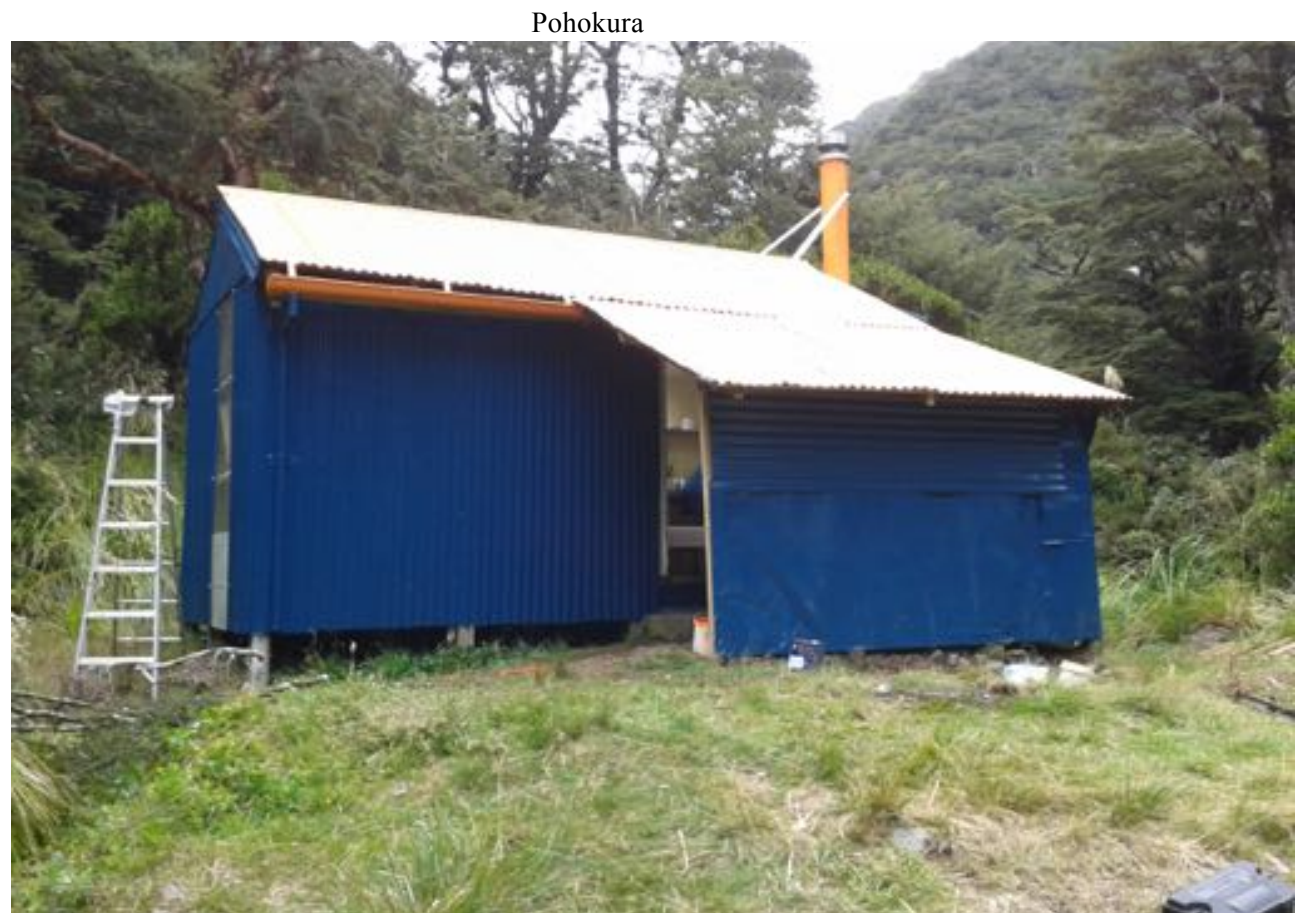
Original-look Waikakamaka Hut with old lean-to porch