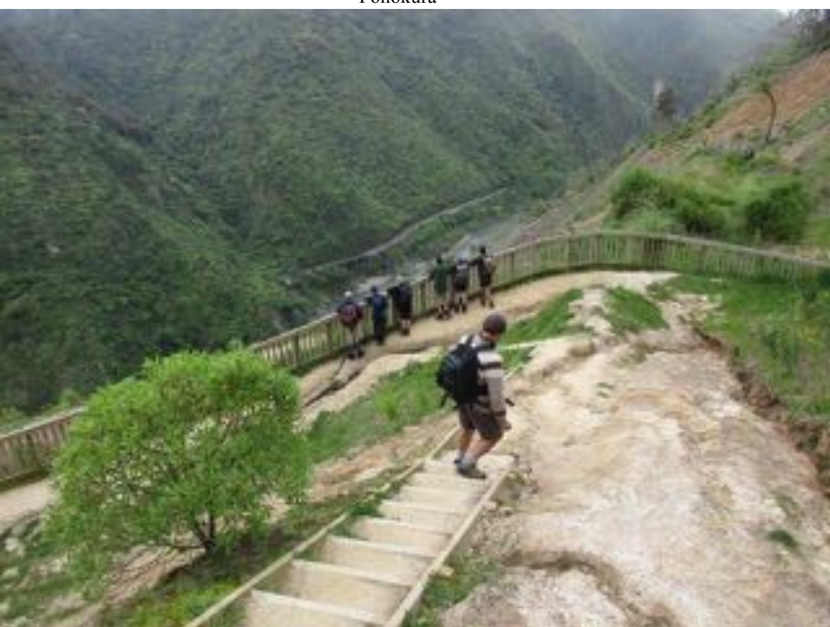
Manawatu Gorge Track with the railway line on the far side of the river