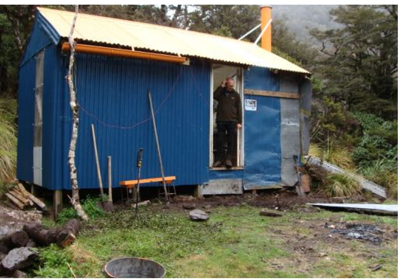
Old porch and concrete step removed; Dave Heaps in doorway