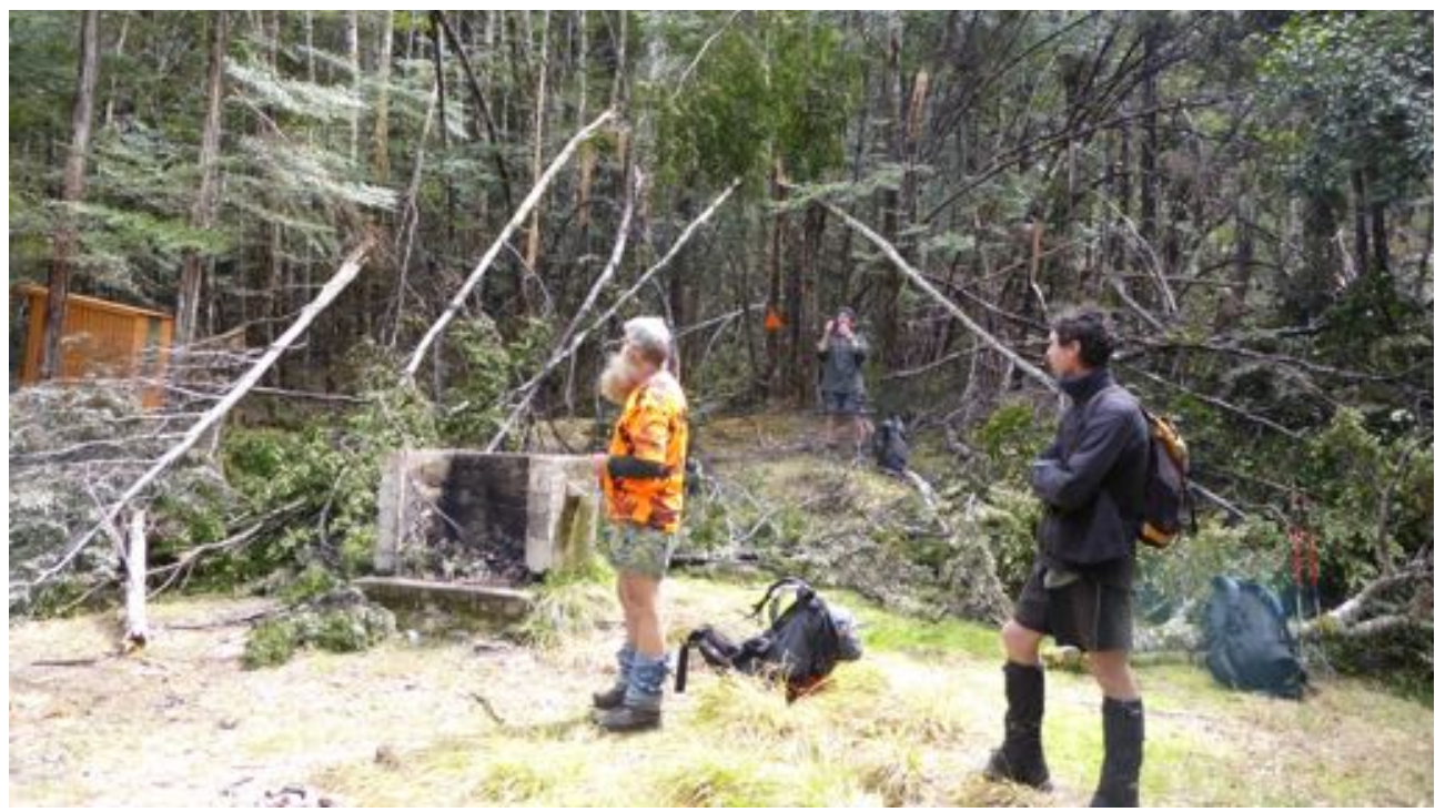
Ex-Kaweka Hut Site

When rain is forecast every second day it does not encourage 'mature' trampers to commit themselves. Well, that is what I suspect happened as only five pairs of boots boarded the truck at 7:00 a.m to head to Lakes Car Park. We expected windfalls on the tracks after seeing the damage to the production forest on Blowhard - mature trees without their upper thirds, broken off by heavy wet snows in August. Even the contorta pines were broken with numerous branches torn from trunks.