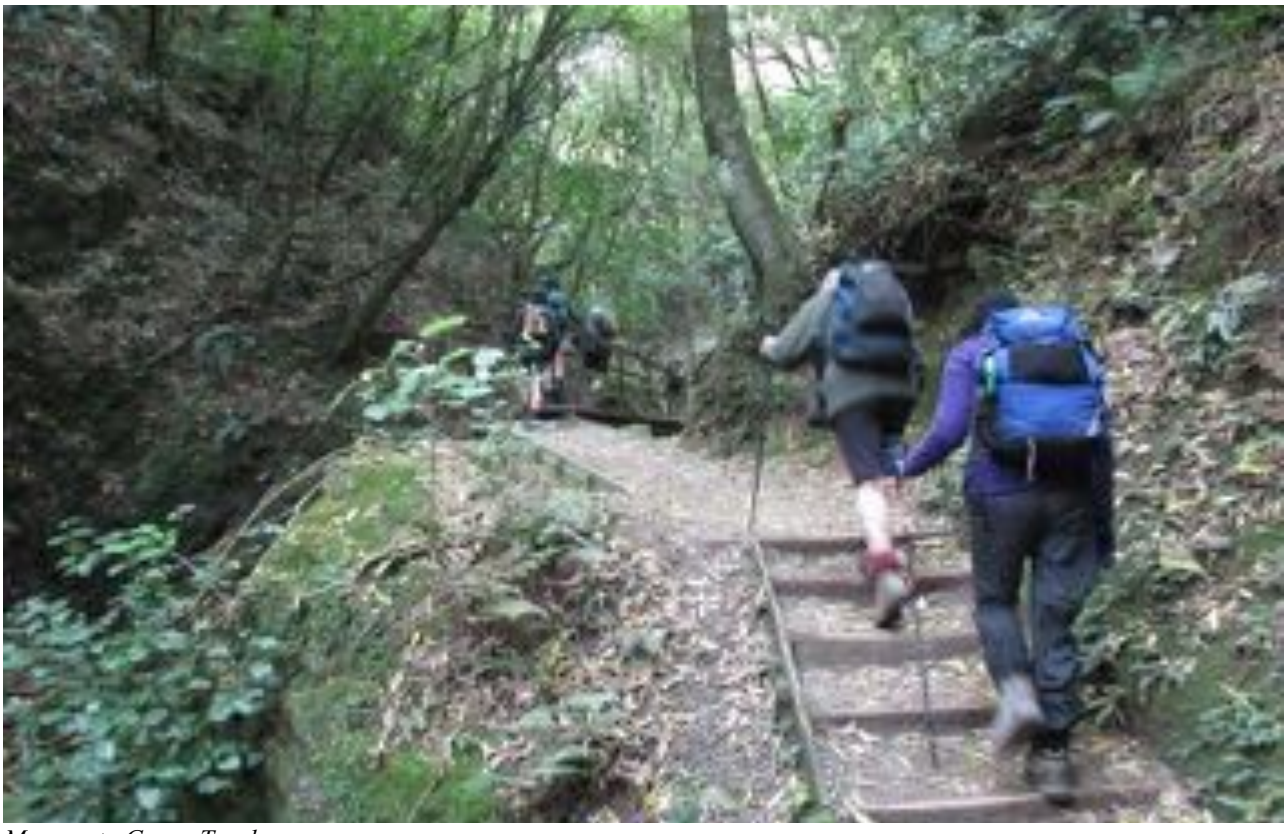
Manawatu Gorge Track