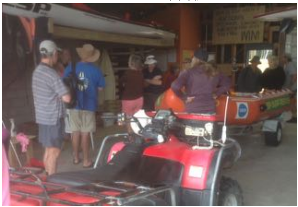
Waimarama Surf lifesaving Equipment