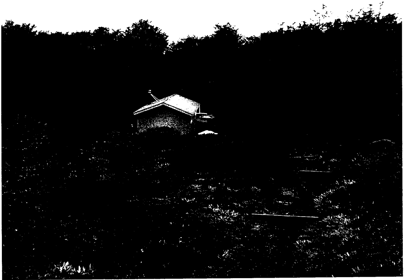
Tira Lodge (aka Kelvinator Lodge) at Venison Tops