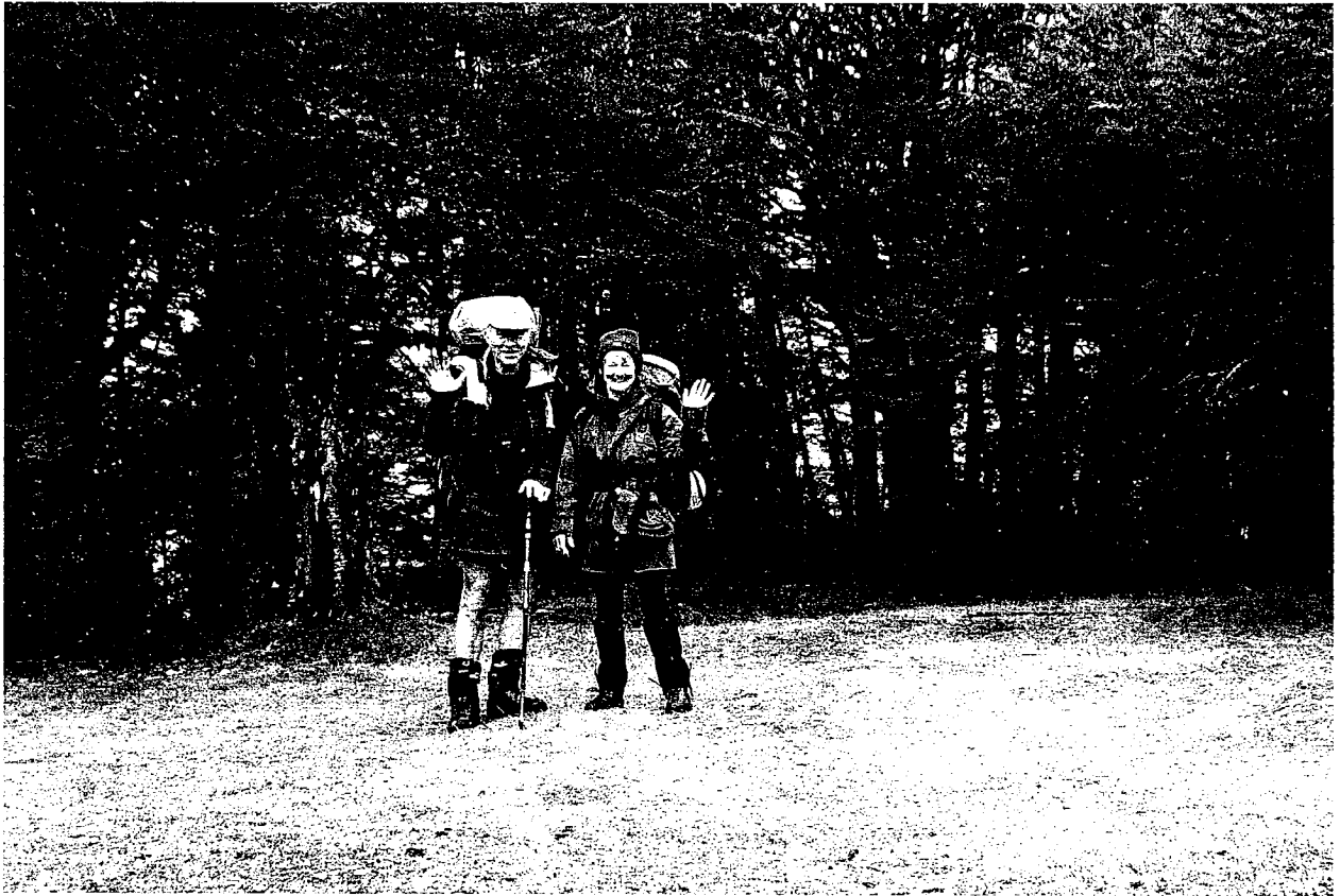
Leaving Tira Lodge

Saturday morning had us moving off across another long and deeper saddle north-west towards the Mangaturutu tops with minimal visibility conditions and a cold wind. We did not linger on the open tops. Back into the bush and down to enjoy a break at Mangaturutu Hut. Forging on down the long Mangaturutu Spur got us to the headwaters of the Makino River which we travelled down in preference to the climb up to Makino Ridge and then down the steep ridge to Te Puia Hut. By now it was raining again and so we had a drippy trip. It's amazing how much water a mingi bush can douse you with! The river was much higher than usual but clear and, in the seven or so kilometres, we crossed about six times to try to pick up the bits of track. This we most often succeeded in doing and scrub-bashed the rest. One crossing was waist deep at the best place but we were pretty wet anyway so, what the heck? It amazes me that, with this valley being a good hunting area, hunters have not developed a reasonable track. There were some rudimentary track markers but they only seemed to indicate the up-river direction. Today had been about 14 km but we dropped about 990 metres.